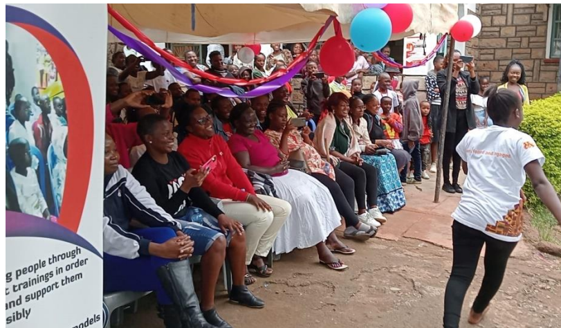
Adults and Children's Day 2023 #adulchiday

CSO believes that consistency, patience and commitment are vital when working with children and young people including community at large and thus it endeavors to instill the same in all her target population by inculcating the same to anyone that gets into contact with our work.